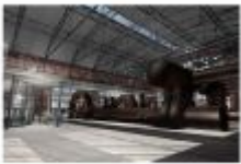
ENERGETICKÁ VEŠTERKA VITKOVIC V ARENĚ IHP V OSTRAVĚ s.r.o.