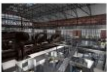
ENERGETICKÁ VEŠTERKA VITKOVIC V ARENĚ IHP V OSTRAVĚ s.r.o.