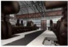
ENERGETICKÁ VEŠTERKA VITKOVIC V ARENĚ IHP V OSTRAVĚ s.r.o.