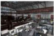
ENERGETICKÁ VEŠTERKA VITKOVIC V ARENĚ IHP V OSTRAVĚ s.r.o.